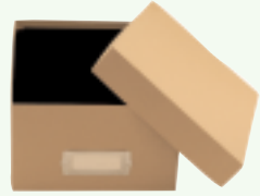
Photo storage boxes are great for organizing more than photos! These inexpensive, versatile tools can be used to store crafts, office supplies, jewelry, small toys, bathroom doo-dads, and so much more. For under $5 each, these boxes are an organizing best-buy. Label them clearly with a label maker or Sharpie pen.